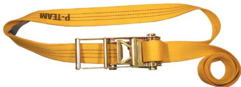
Povezovalni trakovi 75